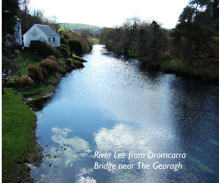
River Lee from Dromcarra Bridge near The Gearagh

The next issue of the newsletter will be available at the end of June.